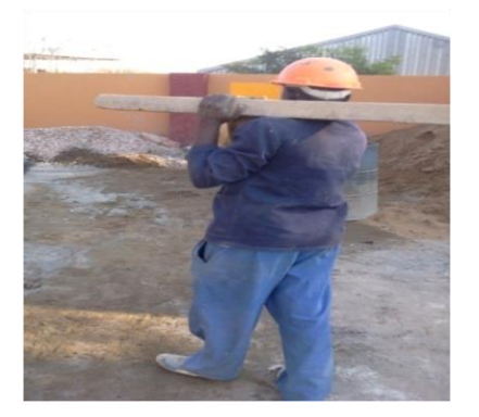
Fig.4: A Photograph showing a construction worker lifting heavy loads.

Depicted in figure 4 is a worker carrying a heavy load resulting in strains over the neck and left shoulder. Material handling and frequent lifting of objects strains the shoulder and arms. The picture shows a worker with both hands holding the load to secure it, which causes both arms to be above the shoulder level.