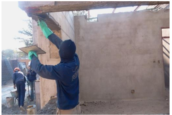
Fig. 2:Picture depicting a construction worker performing repetitive movements.

Figure 2 shows a construction worker plastering a wall. The job requires a repetitive movement and awkward posture for him to work with hands above the shoulder level for an extended period and excessive reaching to plaster the wall above the head height. In addition, the plastering work requires the worker to perform repetitive movement of bending to get the plaster from the trolley, putting it on the hawk, and spreading the plaster on the wall using the float. The plastering activity involves repetitive movement of the arm, shoulder, neck and waist.