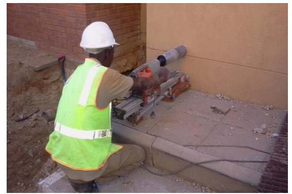
Fig. 3: Picture depicting a worker exposed to vibration whiles adopting an awkward posture at the study site.

The photograph in figure 3, showing a worker using a core drilling machine to make a hole in the wall, depicts an image of a worker who spends an extended period in an awkward posture. It can be noted that the worker is performing work on a very low surface which requires him to kneel or squat. The awkward posture strains the worker's knees, lower back and the neck.