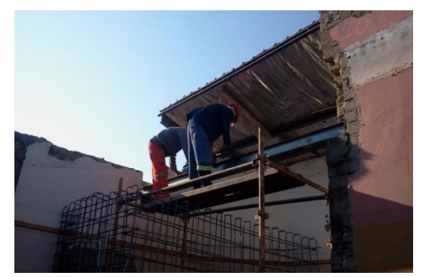
Fig. 5: A photograph showing construction workers performing work in bending positions.

Bending and twisting is one of the ergonomic hazards observed at the construction sites during the site inspection.Figure 5 portrays the photograph of bricklayers laying bricks in the bending positions. Bending for a longer period could lead to back pain.