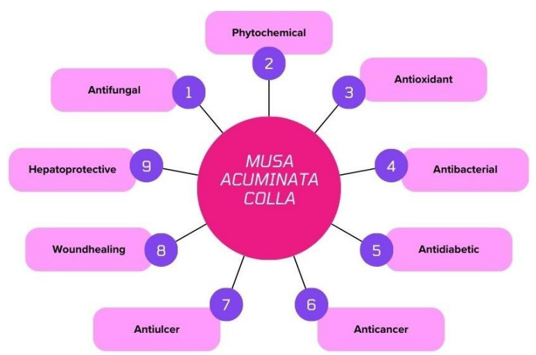
Fig. 1: Diagrammatic Representation of the applications of Musa acuminata Colla.

Red bananas are thought to be an inexpensive and reasonably priced food option that can enhance a weaned infant's nutritional status and lessen malnutrition brought on by hunger. When utilized as a natural supplement, adult food, or as a weaning diet, bananas can help avoid disease. Among global crop importance, banana ranked sixth in terms of export markets. It includes all the elements like dietary fiber, provitamins, minerals, and vitamins—that are critical in reducing the risk of chronic illness. A type of banana with purple-red skin is called a red banana, also referred to as a red dacca. The majority of the parts of the banana plant have medicinal uses, making it the oldest plant in existence. (Amarasingle et al, 2021). The development of low-cost, highly nutrient-dense food supplements is a continuing issue for emerging nations where indigenous foods were employed during the food transition. In the tropics and subtropics, bananas are frequently grown for their decorative and fiber qualities. They are also regarded as an essential food crop. Fungal infections posed a significant threat to the cultivation of mussabrack, which is why there was great interest in muss breeding initiatives. The primary emphasis was on breeding initiatives to enhance the quality of plantains and bananas for human consumption.