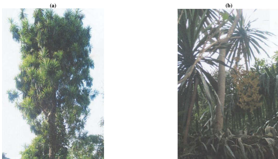
Fig. 2: (A-B): (A) D. mannii and (B) D. arborea