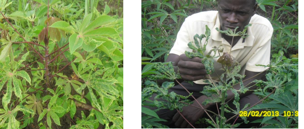
Fig. 2: Several Attack Levels of Cassava Shoots by the Mosaic: 1) A Local Variety (Mpeko) Presenting A Severity Score of 3. 2) An Improved Variety (Sadisa) with a Severity Score of 5.

Concerning the distribution of the local varieties in «Secteur de Boko», it was clearly noticed an increase in the frequency of appearance as we move away from M'vuazi which is a point of diffusion of the improved varieties. Indeed, INERA Research Centre highly recommends to the peasants the systematic abandonment of local varieties so that it was very difficult to find them in the immediate surroundings of M'vuazi.