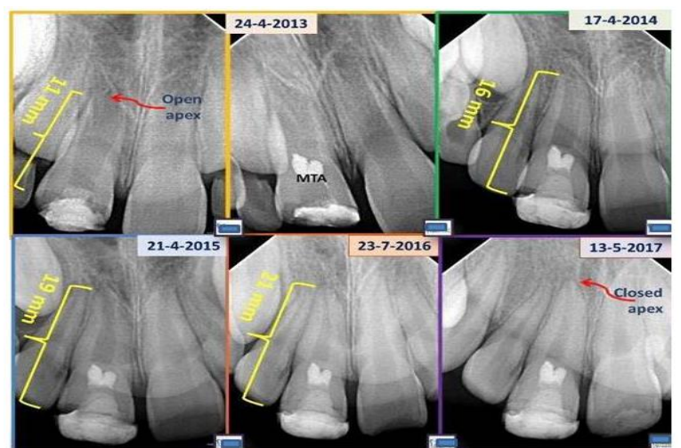
Fig. 2: The Root Development (Approximate Lengths during the Period of Follow up Visits).