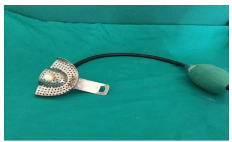
Fig. 1: Customized Balloon Impression Tray.

A stock tray was modified with a hole in the center of the palatal aspect with a diameter corresponding to the tube diameter of a clinical sphygmomanometer. A piece of a vinyl gloves was secured on to the outlet of a clinical sphygmomanometer tube and bulb with the aid of cyanoacrylate or rubber bands. This assembly of a rubber tube with a vinyl gloves was then squeezed into the hole (Fig 1).