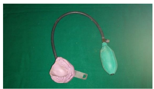
Fig. 5: Recorded Maxillary Impression.

The glove is then distended with the help of sphygmomanometer bulb (Fig: III) Out flow of air is prevented by locking the knob of the bulb. The glove was distended till the patient expressed a feeling of expanding glove against the palate. Pressure was maintained till the material sets. Up on setting of the impression material, air was drained up by unlocking the knob of the sphygmomanometer which assists in easy removal of the impression from patient's mouth. (Fig:IV). Impression was then disinfected for cast fabrication.