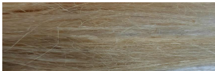
Fig. 4: Jute Fibers After 30 Days Retting.

From the above figure it is shown that jute fibers are slightly randomly oriented in different direction but better than 10 days retting, and the length of the fibers are small but slightly larger than 10 days retted fibers.