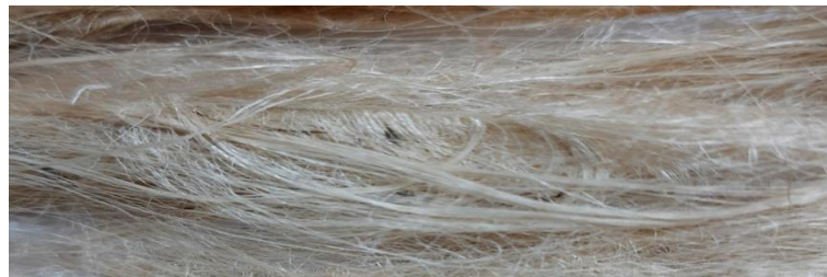
Fig. 2: Jute Fibers After 10 Days Retting.

From the above figure it is shown that jute fibers are randomly oriented in different direction and the lengths of the fibers are small in size from the general fiber length.