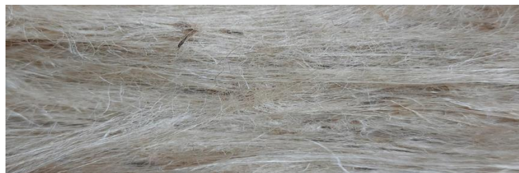
Fig. 3: Jute Fibers After 20 Days Retting.

From the above figure it is shown that jute fibers are slightly randomly oriented in different direction but better than 5 days retting and the length of the fibers are small but slightly larger than 5 days.