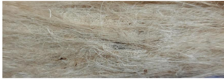
Fig. 5: Jute Fibers After 40 Days Retting.

From the above figure it is shown that jute fibers are slightly oriented than 30 days retted fibers because after a long time retting process the lignin between ultimate fibers are broken down and fibers are turn into small length.