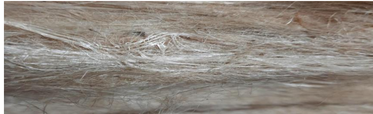
Fig. 1: Jute Fibers After 5 Days Retting.

Raw jute fiber, measuring scale, fiber extractor. Here the samples are given which were got after the retting process.