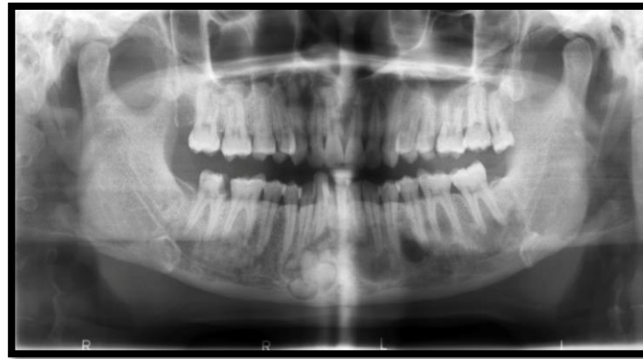
Fig. 1: Orthopantomogram Image Showing Multiple Ill-Defined Radiopacities in All the Quadrants of Both the Jaws and a Well Defined Radiopacity in the Anterior Mandible Surrounded by Irregular Radiolucent Border.