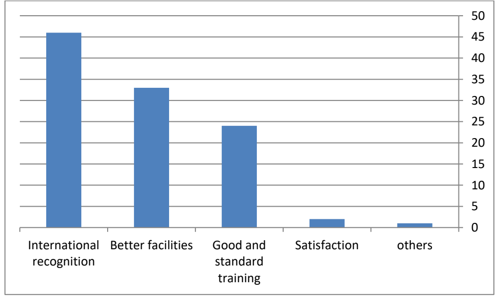
Fig. 1: Factors which Influence Overseas Postgraduates Training.

Factors effecting selecting specialties were related to abroad versus local training are shown in (Fig.1). Personal satisfaction and helping community is the leading factors to select specialty among both groups. Factors which influence abroad or local training were shown in (Fig 2 and 3). International recognition and advanced facilities are the commonest cause of travelling abroad among the students. While free hands on training and social reasons are the most common causes of home postgraduates training.