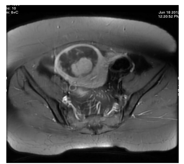
Fig 3: Post contrast axial T1 Fat sat MR image shows enhancement of the solid portion of the uterine SOL along with thin septations. Homogenous enhancement of the rest of the uterine myometrium is also noted.