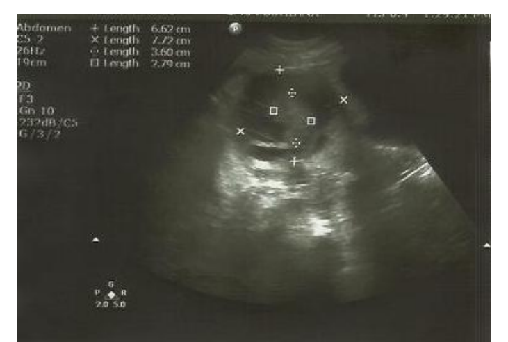
Fig 1: Ultrasonography shows a complex right adnexal cystic lesion with solid component. No increased vascularity was demonstrated on colour Doppler imaging.

Ultrasound showed a large predominantly cystic lesion with thin septations and a mural nodule within it in the right adnexae adjacent to the uterus. No significantly increased vascularity is noted within this lesion (Fig 1). A diagnosis of complex right adnexal cyst was made and further evaluation with MRI was advised.