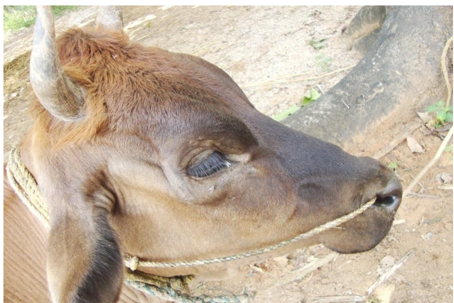
Fig. 2: Sunken eye balls due to T.evansi infection in cattle

All the cattle exhibited high rise of intermittent temperature (103.2^{\circ} \text{ F to } 105.2^{\circ} \text{ F}) , dullness, enlarged lymph nodes, conjunctivitis, corneal opacity, anorexia, sunken eye balls, congested conjunctival mucus membranes, bilateral lacrimation, labored breathing, sudden drop of milk yield and emaciation (Figure-2).