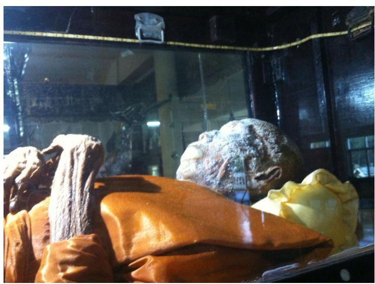
Figure 3: Noble monk body and relics at Thoong-Samakkee Dhamma Monastery, Suphanburi, Thailand in January, 2015