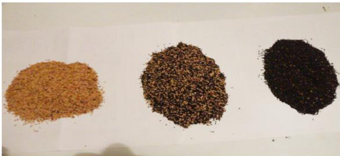
Fig. 1: White, Mixed and Black Types of Finger Millet

The three finger millets white, black and mixed as shown in figure 1 were obtained from the local market of Bahirdar city, in Northwest, Ethiopia. Bahirdar city is located at geographic coordinates of 11 0 35'37" North latitude and 37 0 23'26" East longitudes. The samples were washed off using deionized water to clean from dust particles. They were then dried and subjected to milling using clean agate mortar into very fine powder. The powder form of the samples was again dried at 45 °C in an oven for 24 hrs until each sample deserved a constant weight. Finally, a representative small mass from each sample in the range of 0.250-0.300g was weighed using a four-digit Meter model weighing balance and heat sealed in a cleaned polyethylene sheet. In addition, for the purpose of quality assurance a standard reference material (SRM) of biological origin known as apple leaves (NIST 1515) which was equivalent to the mass of the samples was prepared and packed together with samples in such way suitable for short and long irradiation schemes.