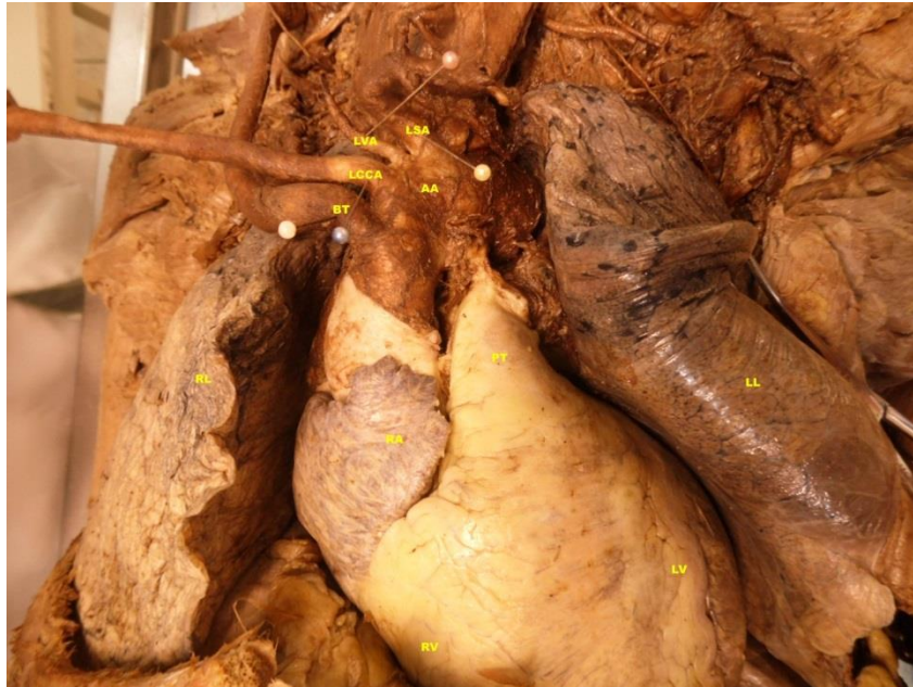
Fig. 1: Anomalous Origin of the Left Vertebral Artery of the Aortic Arch.

During routine dissection on the chest of a dark-skinned male cadaver of apparent age between 55 and 60 years, belonging to the Anatomy Laboratory of the State Health Sciences University of Alagoas, it was observed that the left vertebral artery originated from the aortic arch, between the left common carotid and left subclavian arteries (Figure 1), with a length of 120 mm and a diameter of 5.5 mm. After its origin, the first part of the artery followed its normal course and then entered the transverse foramen of the third cervical vertebra (Figure 2).