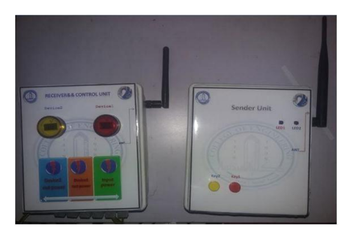
Fig. 5: Transmitter and Receiver units

work to control a device located at distance of 300 meter, and the results show a remarkable controlling on the used device by sending the order of turn ON and reception the order and execution. Figure (8) show the final form of system's units. This wireless control system is comfortable and good choice for the customers who are interested to control their industry appliances, regardless if the devices are AC or DC type, consume high power or low.