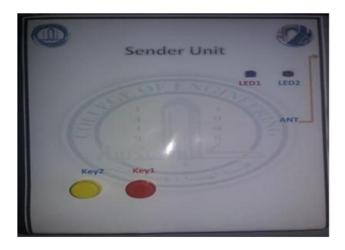
Fig. 5: Sender unit