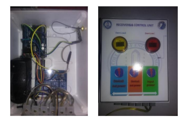
Fig. 5: Receiver unit 5.Result and Conclusion of the work

Industry appliances are selected to be controlled by the prototype system of this work, with a significant preserve consumption of power at the transmitter unit and receiver unit, and easy of using and handling. An experiment were carried out by this prototype