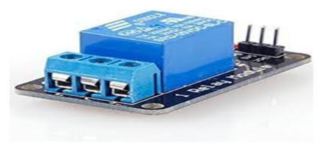
Fig. 3: Relay for switching

Relay is an electromechanical device operates as electromagnetic switch by relatively small current, its mean it has two of movable contacts which can be turn ON or OFF another large electric circuit. The main part of a relay is an electromagnet "a coil of wire that becomes a temporary magnet when electricity flows through it". The advantage of relays is start working with a relatively small power to operate the relay coil as mention above, but the relay itself can be used to control a large circuit or appliance such as motors, heaters, lamps or AC circuits which themselves can consumption a lot more electrical power [7]. The relay used with this work is shown in figure (3)