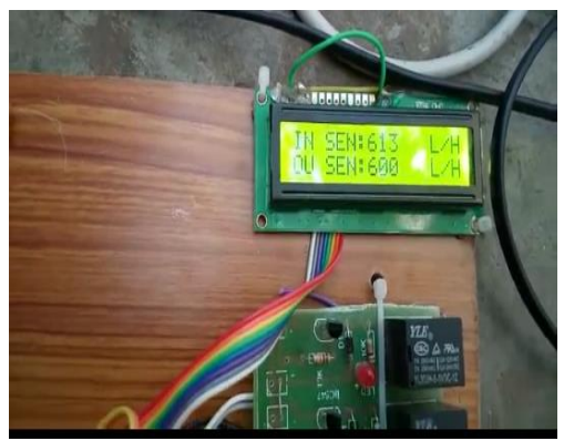
Fig.4 Display of water Inflow and Outflow

The LCD display of inflow and outflow of water with unit L/H. Here we are having a little variation due to having improper arrangement to pipeline.