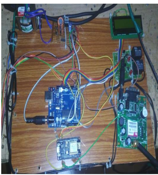
Fig.2 Board with connections

The flow of water in pipeline from inflow to outflow according to the arrangement of the sensor.