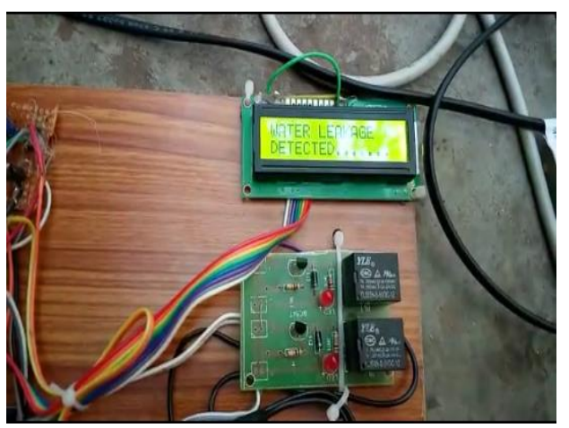
\textbf{Fig.6} \ \text{Water leakage detected show in LCD}

As the water leakage is done in the LCD it shows that water leakage is detected