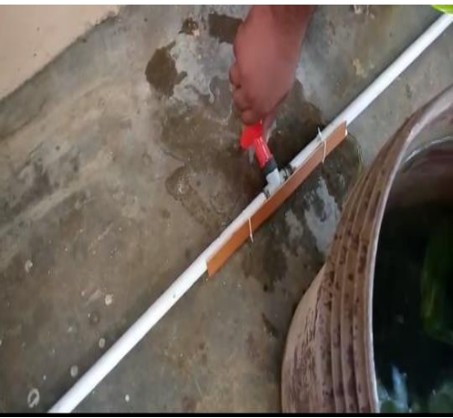
Fig.5 Water leakage area

To show weather leakage is detected or not in pipeline we have arranged a area for leakage. When leakage is on the water leakage will be detected and motor off so that there will not be any flow of water.