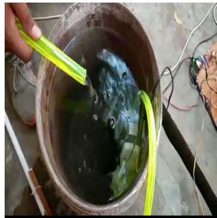
Fig.3 Water Flow in pipelines

The flow of water in pipeline from inflow to outflow according to the arrangement of the sensor.