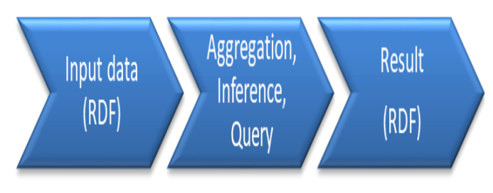
Fig. 1: Extraction of knowledge

Semantic web application inherits Open-ended, Diverse and semistructured information. Semantic web collects the diverse data from the eclectic sources on the web and integrate them to form a new knowledge that focuses on the information required by the end-user and displays them to provide required information.