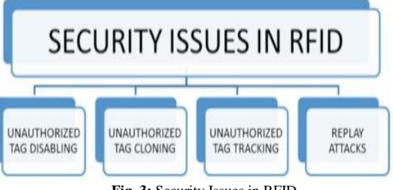
Fig. 3: Security Issues in RFID.

Sanctuary problems in health-associated tools constructed up the idea of IOT: Improvements conjunction of manufacturing with ecol- ogy has cemented the manner for immersed fitness ob- serving gadgets which could continuously circulation and proportion the data receive the sensor to the well- ness show along with various gadgets and social group over the web (The execution of social network with the sensor certainties can be seen in [13], [10] and [11]). The execution of automated gathering of certainties by methods for the sensors and bringing in it to the differ- ing open systems through a web server reports some over the top lack of protection inside the entire records communicate procedure from screen to the Internet. The possibility in its objective apparatus (FITBIT), the creators of ([13], [12]) have analyzed the accompanying as the guideline security presentation way such wellbe- ing checking gadgets occupied in uniting with Internet: