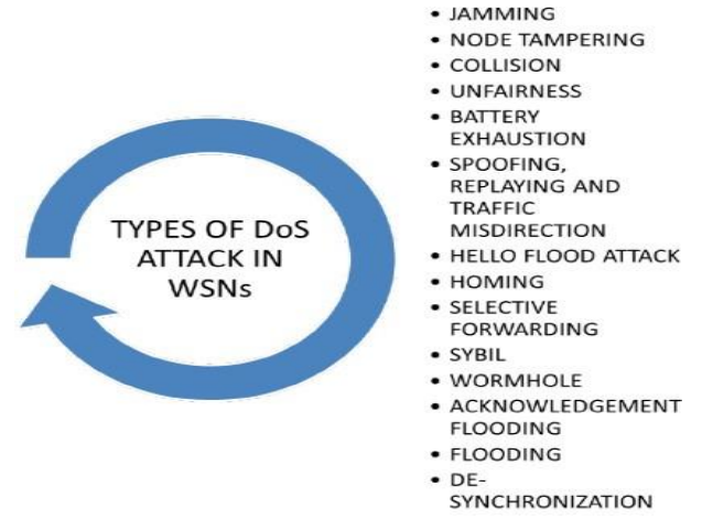
Fig. 2: Types of Denial of Attack in Wireless Sensor Network.

Denial of Service attack on the delivery lev- el: