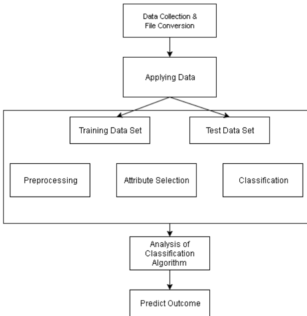
Fig. 1: System framework