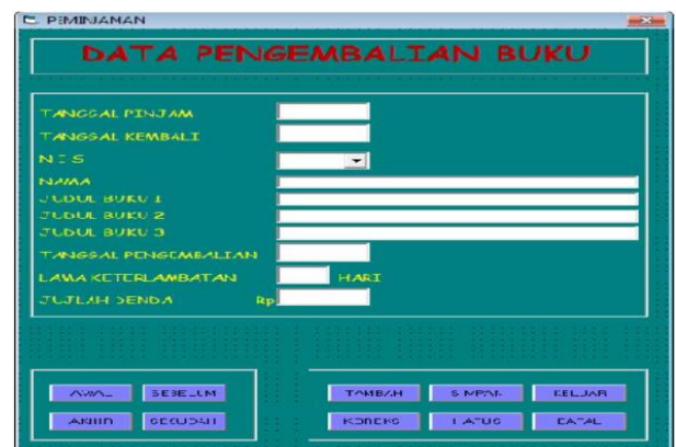
Fig. 3: Figure Book Returning Form.