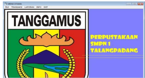
Fig. 1: Main Menu Form.