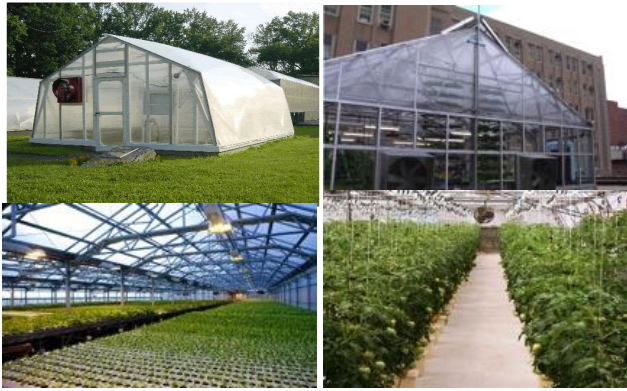
Fig 1. Greenhouse and supporting tools (greenestcity.ca)