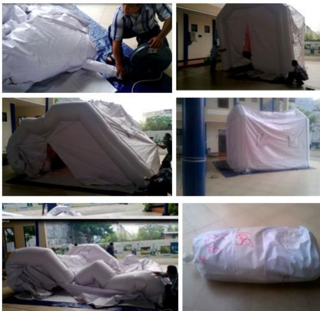
Fig. 2. Portable Urban Agriculture Technology