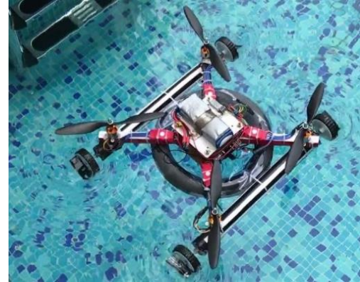
Fig. 8: Multimodal vehicle propelling in water