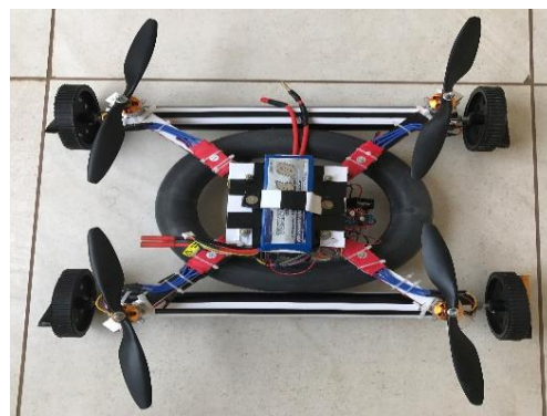
Fig. 5: Unmanned multimodal vehicle-Top View

The electrical system is considered most critical for the development of a stable prototype. All parts and sub-assemblies are integrated together to form the final assembly of unmanned multimodal vehicle. The weight of the vehicle is measured and it agreed with the calculations discussed in previous sections. The final assembly of unmanned multimodal vehicle is shown in Fig 5 and Fig 6.