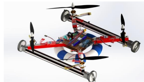
Fig. 3: Complete assembly of multimodal vehicle

UGV frame is designed to be circular and hollow PVC pipe of diameter 3.81 cm and has a length of 39 cm to suit the frame of the UAV. The circular shape enables the sealing of the motors in the pipe during its navigation in water. The pipes also enable better stability and buoyancy when in water. Instead of using separate propeller mechanism to drive the vehicle in water, a flat metal piece made from stainless steel is attached to the central axis of each wheel. For floatation purpose, a tube filled with air is used. The CAD assembly of the vehicle is shown in Fig 2. The calculation for floatation is discussed later after the selection of electronic components. The total weight of the components to be used to develop CAD assembly into a prototype was observed to be 1.4 kg. The conceptual design of the vehicle after addition of all the electronic components is shown in Fig 3.