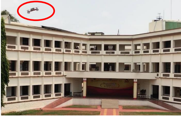
Fig. 7: Unmanned multimodal vehicle – flight test

tube was in agreement with the experimental results. The circular tube sank up to a depth of 2.3 cm and also balanced the weight of the vehicle. The multimodal vehicle travelling in water is shown in Fig 8.