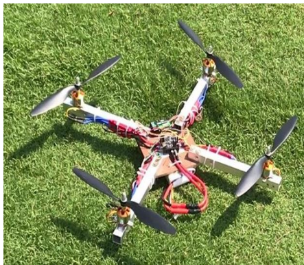
Fig. 4: UAV sub-assembly