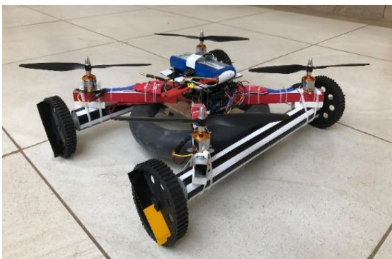
Fig. 6: Unmanned multimodal vehicle

By substituting T= 300K , R=287 \text{ J/kgK} and P=8 \text{ bar} in above equation, we get \rho = 9.286 \text{ kg/ m}^3 . From concepts of buoyancy,