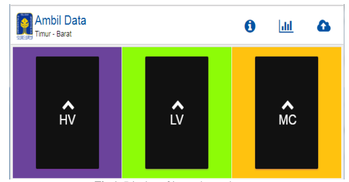
Fig 1: Display of input data volume

The number of vehicle was collected based on the type of vehicles. On this application, the type of vehicles classified with heavy vehicle/HV (vehicle with passenger capacity more than 8 or vehicle with heavy load), Light Vehicle/LV (vehicle with passenger capacity equal or less than 8 or vehicle with light load), (motorcy-cle/MC (two-three wheels motorized vehicle), The display of the data capture volume and the composition of the traffic on the application can be illustrated in Figure 1 below.