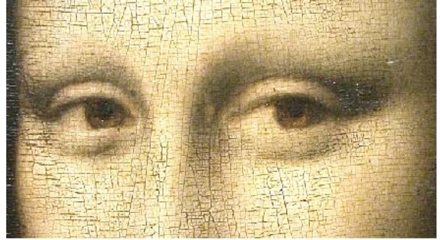
Fig. 3: Original cracked image

Fig. 3 shows the original colored images that suffer from cracks that need to be restored and displayed on GUI: