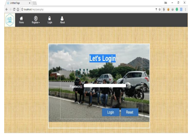
Fig. 3: Personalized password page with custom background image.

After entering the correct username and passphrase combination the user is redirected to a personalized login page as shown in Figure 3. It has a custom watermark image in the background, as set by the user during his/her registration.