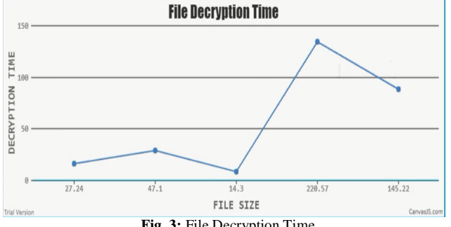
Fig. 3: File Decryption Time

The figures fig. 2 and fig. 3 demonstrates the time taken by the application to encrypt the information. There are numerous clients utilizing the cloud services with a specific end goal to spare their information. One of the fundamental parameters is the time taken to encode and decode the information. Availability of information is one of the benefits of the proposed application, along these lines, the application ought to give speedier transferring and getting to of information. For accomplishing this favorable position it is critical to figure the time required to encrypt and decrypt the information. The application will be more proficient on the off chance that it can give security and speedier transferring and getting to information. Unwavering quality gave by the cloud servers causes the clients to store their private information without the dread of unauthorized access