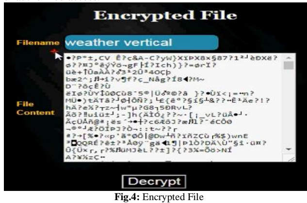
Fig. 4 shows how the data is encrypted at the application and how it is kept safe from unauthorized access. When the user clicks on decrypt button, the user request is sent to the consumer who uploaded the data, the consumer will send the key into the user's email and when the user enters the key he can access into the data. As mentioned in the previous sections, a user can only decode the encrypted file with the permission of the consumer who has the authority to provide permission, hence the data is safe from unauthorized access.

The figures fig. 2 and fig. 3 demonstrates the time taken by the application to encrypt the information. There are numerous clients utilizing the cloud services with a specific end goal to spare their information. One of the fundamental parameters is the time taken to encode and decode the information. Availability of information is one of the benefits of the proposed application, along these lines, the application ought to give speedier transferring and getting to of information. For accomplishing this favorable position it is critical to figure the time required to encrypt and decrypt the information. The application will be more proficient on the off chance that it can give security and speedier transferring and getting to information. Unwavering quality gave by the cloud servers causes the clients to store their private information without the dread of unauthorized access