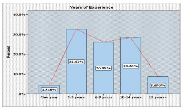
Fig. 3: Years of Teaching Experience

In relation to the respondents' qualification, they were also asked to provide their experience through choosing the appropriate yearset for their teaching. In the questionnaire, each participant would have to tick/choose only one out of five choices: 1) one year; 2) 2-5 years; 3) 6-9 years; 4)10-14 years and 5) 15 years and above. The results showed that the teachers proportion differences among the 2<sup>nd</sup>, 3<sup>rd</sup> and 4<sup>th</sup> sets are moderate (32.6%, 26.1% and 28.3% respectively) and they were widely high comparing to the 1st and the 5<sup>th</sup> sets (4.3%. and 8.7 respectively). In a sense, a total of 15 teachers were 2-5 years experienced, 12 were 6-9 years and 13 were within 10-14 years teaching English. On the other hand, only two fresh teachers participated symbolizing the extreme negative tail of seniority and four teachers were of 15 years and above experience constituted the extreme positive tail of seniority. Figure 3 summarizes the percentages of the participants and visualizes the concepts of the teachers' period of teaching English.