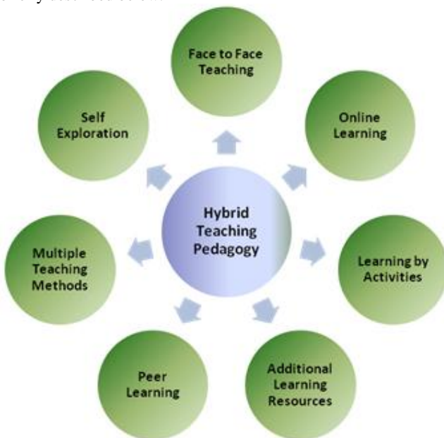
Fig. 3: Ingredients of Hybrid Teaching Pedagogy

Hybrid teaching and learning [8] is now being considered far better than solely conventional and online teaching and learning. In Hybrid pedagogy a portion of time is devoted for online exploration of the content that helps in-depth comprehension of the concepts and theories [3]. To endow with the best teaching and learning a hybrid teaching pedagogy which integrates face to face teaching and online learning involving the ingredients or features mentioned in Figure 2 are required. These features have been briefly described below.