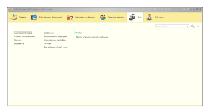
Figure 5:. Screen form of the subsystem "Personnel"

When you move the cursor to the "Personnel" section, the help is displayed on the subsystem. Personnel is the entire staff of the organization's employees, performing various production and economic functions. Personnel management is a set of logically related actions aimed at optimizing the workforce of an enterprise (personnel) in the aspect of their activities, qualitative and quantitative characteristics, in order to rationally achieve the goals set for the organization. It is carried out through a certain mechanism. This mechanism consists of control elements [5].