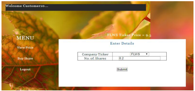
Figure (6.3): User view Price

In the above Figure (6.2), the user can sign in by using its user name and password and can view the current market price for the particular ticker.