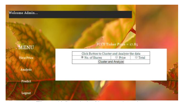
Figure (6.4): Admin Cluster and Analyze

In the above Figure (6.3), the user selects the company whom they need to invest and view the current market price and buys the respective shares.