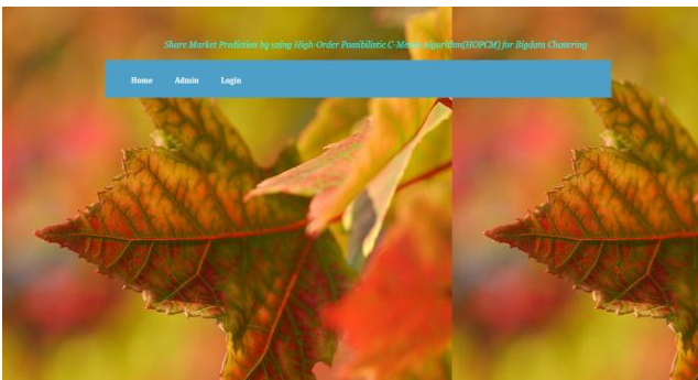
Figure (6.1): Home Page for User and Admin Login

In the above Figure (6.1),theuser and admin can register by using his name, mail id and assign a password.