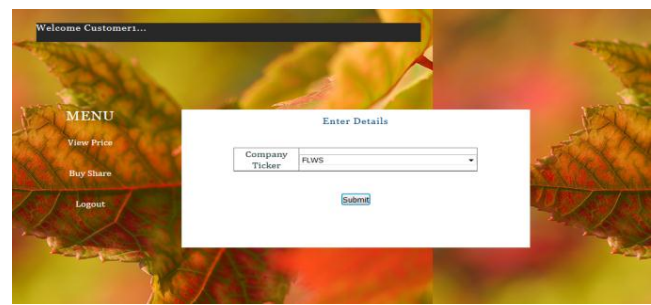
Figure (6.2): User Home Page

In the above Figure (6.1),theuser and admin can register by using his name, mail id and assign a password.