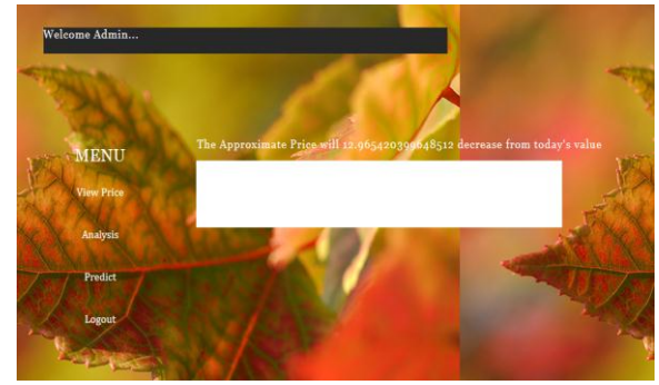
Figure (6.5): Admin prediction

In the above Figure (6.4), the admin login page will similar as the user login in addition to the analysis and predict phase. In this, the stock market expert's will cluster and analyze the particular shares to which the investors are acquiring.