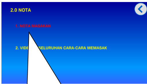
Figure 5: The explanation and navigation

Notify the users on the selected menu through the change of colors