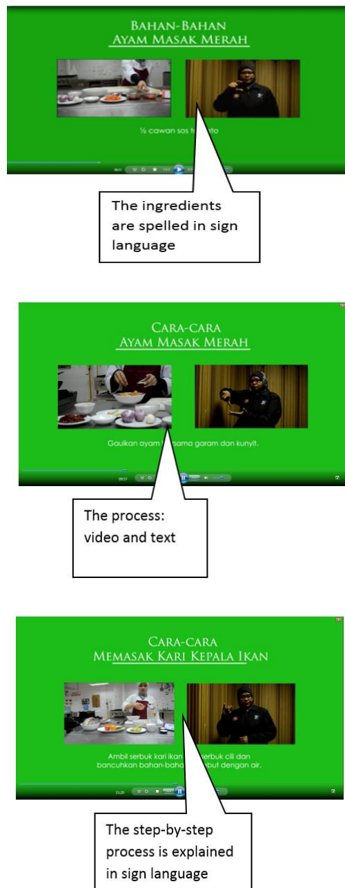
Figure 1: Snapshots of the AV4HI

Figure 1 illustrates that the AV4HI combines various content channels. The text is minimized in conveying the contents. Rather, video is used, consisting of a video displaying the process coupled with a video of sign language explaining the process being showcased.