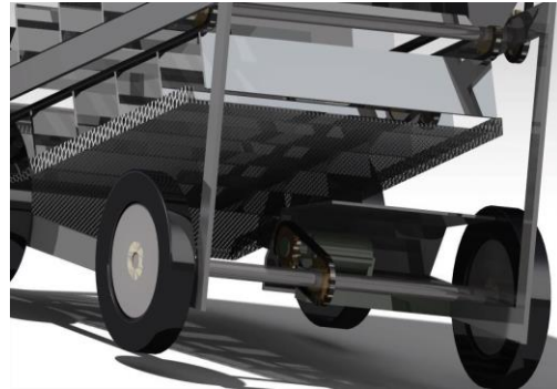
Fig 1:- 3D model of conveyor and drive

The conveyor is a mechanical transmission device that is used to transmit materials, goods from one place to another over a midrange distance in a stable position. They involve in the movement of materials in a vertical position, or inclined position, or at an elevated angle. Conveyor chains are used for longer distances and at low speeds. Rake is the frame like part which holds the weight of the transmitting object over the belt. Product design is now not confined to few creative artists, can be learned by systematic study. Fortier stress was laid on design as a synthesis of stress analysis, theory of mechanism and machines and another subject like machine design and dynamics of machinery. But current approach is to expose the student is uncovered to solve a real problem with various optimization tools. Here to transfer the garbage the conveyors are used. Conveyors are set in a way such that the garbage is made to fall over it. Then the garbage which is fallen is safely stored in the container as they directly deposit over it. Based on the size of the container the storage level may vary.