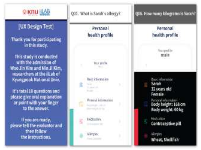
Figure 2:. UX test app screens used in the experiments

For Group B (individuals with no disabilities), contrary to the expectation before the experiment, visual information recognition speed in Part 2 was higher than in Part 1, which was the same for Group A.