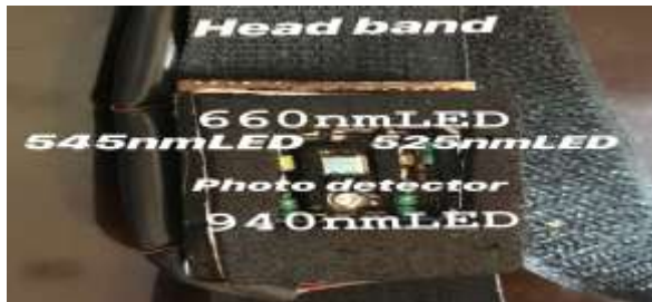
Fig.3: LED with Photodetector

On the whole, it is seen that monitoring of the parameters such as SpO_2 , total hemoglobin count and heart using the non-invasive method measurement over the forehead region in supine position gives more accurate measure. This model resulted in incorporating the values of the photodiode output with the relationship formula stored in the microcontroller to process the output and display in the LCD Display. A study of fifteen subjects was analyzed. Relevant results were obtained from 525nm. The student T-Test was performed between total hemoglobin count measured from 525nm wavelength LED in forehead oximeter and the total hemoglobin count from a traditional blood test. The statistical student T-Test was done to compare the hemoglobin count obtained from both methods. The significant value obtained from student T-Test was 0.06 which indicates that both the hemoglobin count values taken from two different methods are the same.