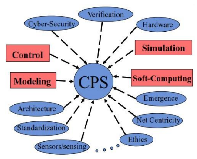
Figure 2: Challenges posed by CPS[8]

There are various advantages of adopting the CPS in smart city.