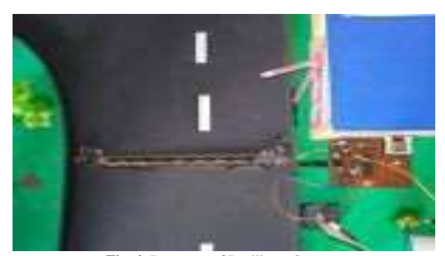
Fig. 4: Prototype of Intelligent System.

The prototype as shown in Fig.4. Is tested in three different scenarios to find the results.