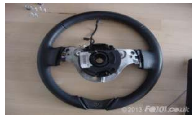
Fig. 1: Steering Wheel with Angle Sensor.

As shown in the Fig.1. The implementation angle senor in the steering wheel will be mainly used to identify the angle of driving carried out by the driver. If the Driver is not following proper angle and there is a disturbance in the angle of direction that information will be sent to Intelligent device fixed and based on the disturbance the device will take the decision either to stop the vehicle or pass the vehicle.[2].