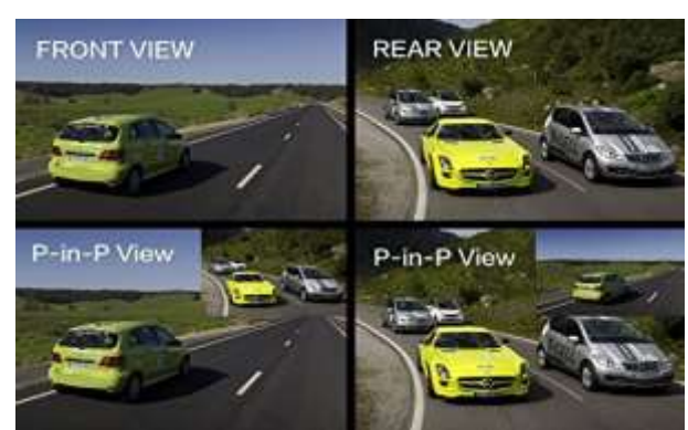
Fig. 2: Lane Camera to Find the Lane Discipline k.

If the driver is not reducing the vehicle speed after certain messages also the intelligent device which is connected will automatically stops the vehicle. [4].