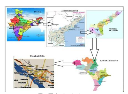
Fig II.1: Study Area

can be classifies and categorized by using [1]. supervised, semisupervised, and unsupervised machine learning techniques. For the classification feature relevance is also very important then only we can learn the data very accurately. In this we are predicting Feature subsets.