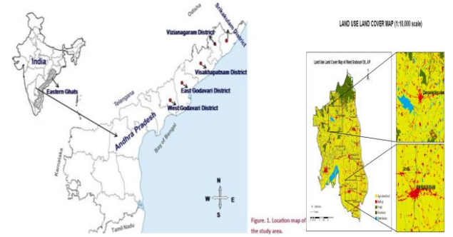
Fig V.1: Study Area Map for feature Extraction Fig V.2 Land Use /Land Cover

combining other techniques will get accurate results all these results compare with Kappa coefficients [11].