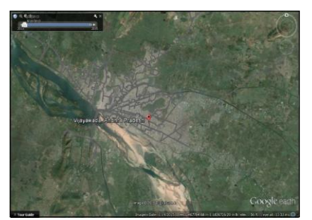
Fig II.2: Andrapradesh Google Map from Google Earth