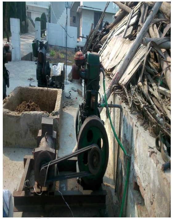
Fig.4: Diesel Engine and Alternator set

To rotate the alternator, a multi-tasking engine is used, which are easily available in the villages for grass cutting, pumping water and flourmill, etc. Such kinds of machines are adjustable, modifiable. We can use the same machine for two works simultaneously like grass cutting and rotation of alternator as well. Therefore, with a small investment, villagers can meet their demand of electricity production, where the input of the machine is the fuel which produces torque to rotate the rotor of the coupled machines. The system used in the Sabhamajara, Saharanpur (U.P.) India is the combination with an engine and an alternator as shown in Figure 4. In the system shown in Figure 4, inlet fuel can be both liquid (Diesel, Kerosene) and gas fuel like LPG, Biogas, depend upon the availability of the type fuel, which they have in the excess. Only gas fuel cannot be used without modification, it required an additional gasket to take gaseous fuel.