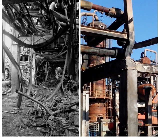
Fig. 3: Deformations after fire obtained by Trimble TX5 laser scanner

remove noises, and to trim the resulted point cloud [16].