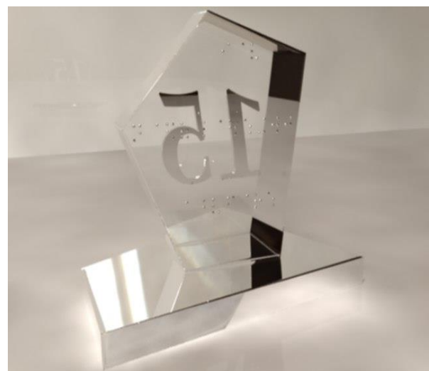
Fig. 6: Statuette - Wedding Anniversary - rear view