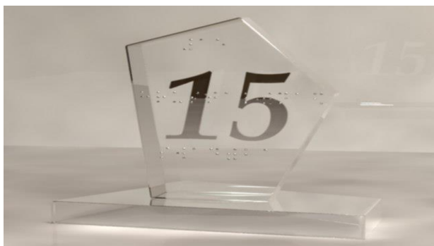
Fig. 3: Statuette for the anniversary of the wedding - "15-crystal wedding" front view

The family lives life to the fullest, they go out into the countryside, go to the sea, go hiking in the mountains, in the woods and like to celebrate their wedding annually. For this couple, a gift design was developed as a souvenir for the next anniversary of the "15 - crystal wedding" (Fig. 3-6)