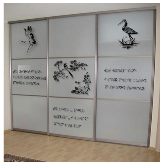
Fig. 2: Wardrobe - ornamental pattern with braille

Thus, it was proposed to expand the use of Braille as an ornamental decoration of souvenirs for significant dates, anniversaries and celebrations.