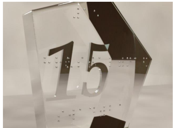
Fig. 5: Statuette "15-crystal wedding"

This figurine was designed without a sketch in the Autodesk 3DMax program - it is a graphic program with which it is possible to do 3D modeling, editing and creating animation. With this program, 2D and 3D objects are designed, different textures are created and overlaid, you can edit the design of materials. [7]