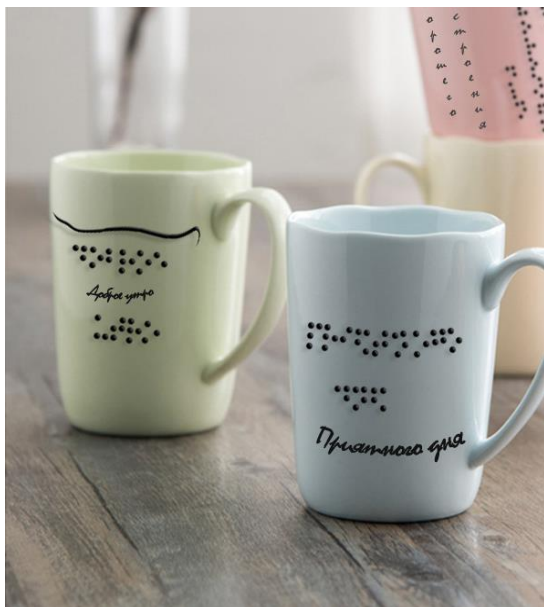
Fig. 1: Decorative design of the mug using Braille

We have already discussed this problem at the international scientific-practical conference on universal design in 2016. [2]. And at the international scientific and technical conference "MNTK PTI - 2017". [3]. According to the results of which collections of scientific works were published, where options for creating products in Braille were proposed (Fig. 1, 2).