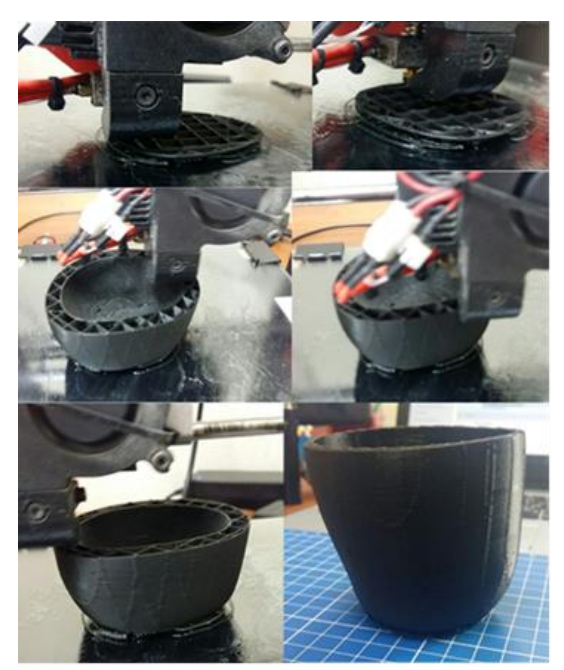
Figure 3: Stages of 3D printing of a culture receiving sleeve

Further, the cultivation of the layout of the cult-receiver sleeve of the children's NCP was performed on a rapid prototyping unit (Figure 3).