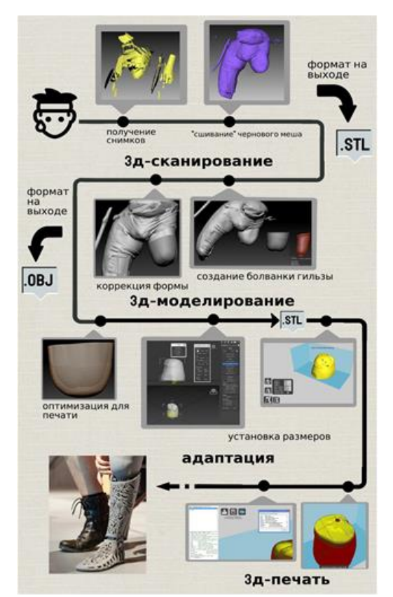
Figure 1: Diagram of the technique of applying 3D printing technology in lower limb prosthetics

The method of manufacturing a culture receiving sleeve includes several steps (Figure 1):