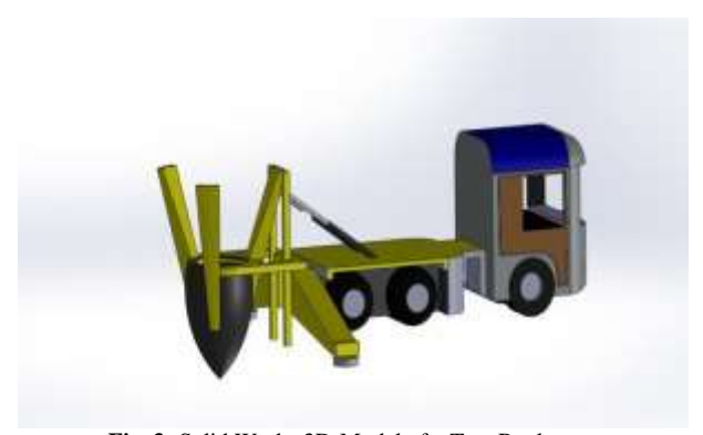
Fig. 3: Solid Works 3D-Model of a Tree Replanter.

extruded to add or remove material from the part. The pro-posed model is a 3-D sketch consisting of solar powered 3 spade model and it is shown below in figure 3.