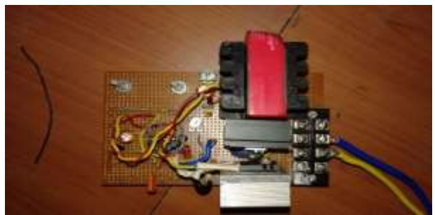
Fig. 1: Buck Converter.