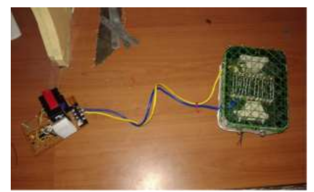
Fig. 2: Buck Converter Along with the Dynamic Load.

This is the resistance of one strip of coil, i.e.50 cm. By arranging strips of this coil in parallel to produce a resistance of 0.16 \Omega , we can construct the resistor design.