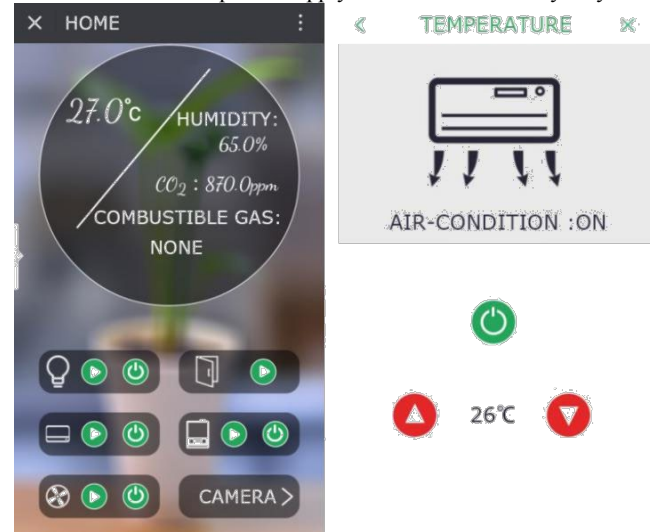
Fig.3: View of WeChat