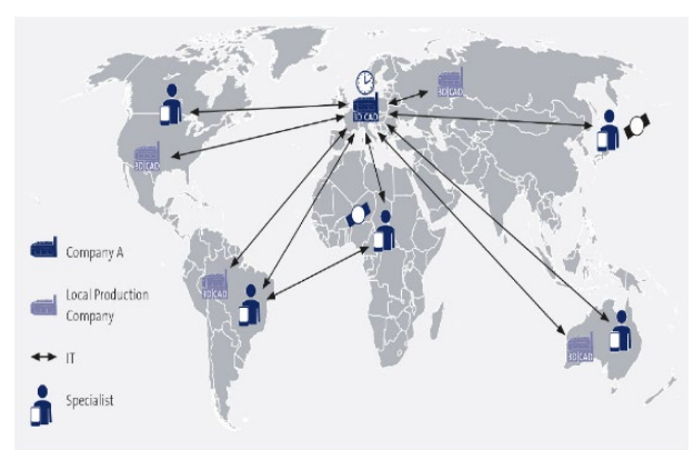
Fig. 2: Concept of distributed manufacturing for wristwatches

iii. New partnership models between companies, mainly horizontally, but also vertically [6]. Supply chain is basically a partnership ecosystem. As time moves on many forms of partnership between associates along the supply chain have developed. Momentums created through digitalization which gives to this reality new complexity. As a result, less important become the company boundaries to improve the efficiency and flexibility of supply chains. Vertical collaboration models common across industries but from the competitive standpoint horizontal partnership is always identified as a risk. But now high potential of cost savings through joint procurement services and shared use of transport and storage capacities is the key motivation for horizontal collaboration. Risks along the chain is mitigating as sharing of information to seen as an enabler of horizontal partnership.