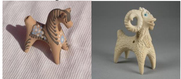
Fig. 3: Opryshnyanski ceramic toys

It should be noted the commercial form usage effectiveness, image and actual copies of folk Opishnya ceramic products for the brand joint promotion of well-known goods from the Poltava region, and the general image of the region as a whole in the minds of people, forming a sense of patriotism, aesthetic tastes development, unique ethno cultural traditions preservation. Ceramic toys samples based on chocolate products which can be created are shown in Figure 3.