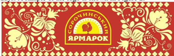
Fig. 2: "Sorotchinsky Fair" logotype

In 2014 PJSC "Poltavakonditer" started production under the new "Sorotchinsky Fair" trademark. From our point of view, It is very useful, because Sorotchinsky Fair has long been known far beyond Ukraine. The brand name will further attract attention and cause a positive emotional response from consumers, because "Sorochinsky Fair" is closely linked to the history of Poltava region with its ethno cultural uniqueness: the Great Sorotchintsy, famous fairs, the famous literary genius of M.V. Gogol. The logo of the new TM "Sorotchintsky Fair" red cock against the background on the rising sun is a symbol of fire, blossoming and holidays. A sample of the logo is shown in Figure 2.