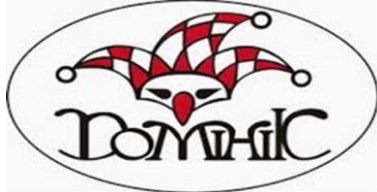
Fig. 1: TM "Dominik" logotype

PJSC "Poltavakonditer" is one of the ten best confectionery enterprises in Ukraine [10]. The company until 2014 produced products under the trademark "Dominic" (Figure 1).