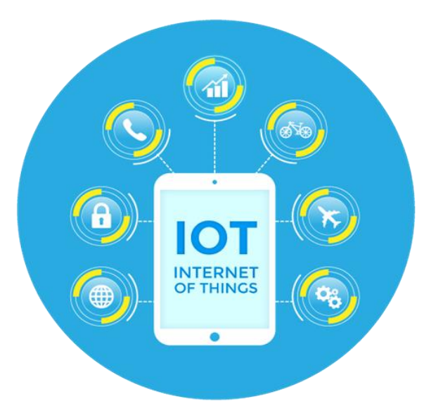
Fig 1. Internet of things (IoT) Architecture

The changing narrative in the technological industry brings a revolution in the electronic industry which gives a wind blowing impact on the emergence of smart devices to enable smart connected vehicles, smart industry inside the smart network, smart applications in healthcare, transportation, homes and other emerging areas. In this complex scenario, the application of IoT paradigm in an urban context is an emerging trend. Since the initiative taken by many countries towards the utilization of ICT services into government domains and public affairs is largely focused on IoT ecosystem resulting into a concept of "Smart City". The major aim in this development is to make better use of public resources and improving the quality of the service to the citizens while reducing the operational cost incurred on the public administrators. An Urban IoT paradigm bring many benefits in the management and enhancement of transport, surveillance, hospital, police, municipal services and schools [3]. The large number of smart devices connected having diverse range of application with Internet in smart cities has given some major concerns related to scalability, efficiency, distribution, availability, flexibility and security in the existing smart city network.