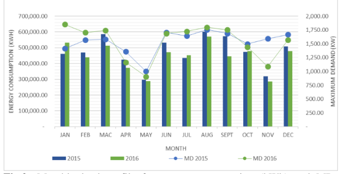
Fig.2: Monthly load profile for energy consumption (kWh) and MD between 2015 and 2016.

Next, the understanding of energy consumption in this pilot university was done by analyzing the average monthly electrical load profile and its MD as depicted in Fig.2. The respective load profile is to demonstrate and distinguish the pattern of electricity consumption between 2015 and 2016. From the graph shown in Fig.2, higher energy consumptions were marked at the month of June until October and December until April at year 2015 and 2016. This is due to the full occupancy of campus residences since the academic semester is running at this month. Observed that during month of March and August, the energy consumption has reached to its peak due to summer season that affecting the amount of solar radiation received and heat, hence, increasing the usage of cooling system. Furthermore, due to the restructure of occupancy timetable, the operating time of coolant chillers were reconfigured and shortened about 3 hours from its daily usage. As for consequences, observed that starting February 2016, there were significant reduced of monthly energy consumption by 12% after the said action executed. In most cases, the number kW of MD recorded in Fig.2 is approximately 20% higher than the average total monthly usage.