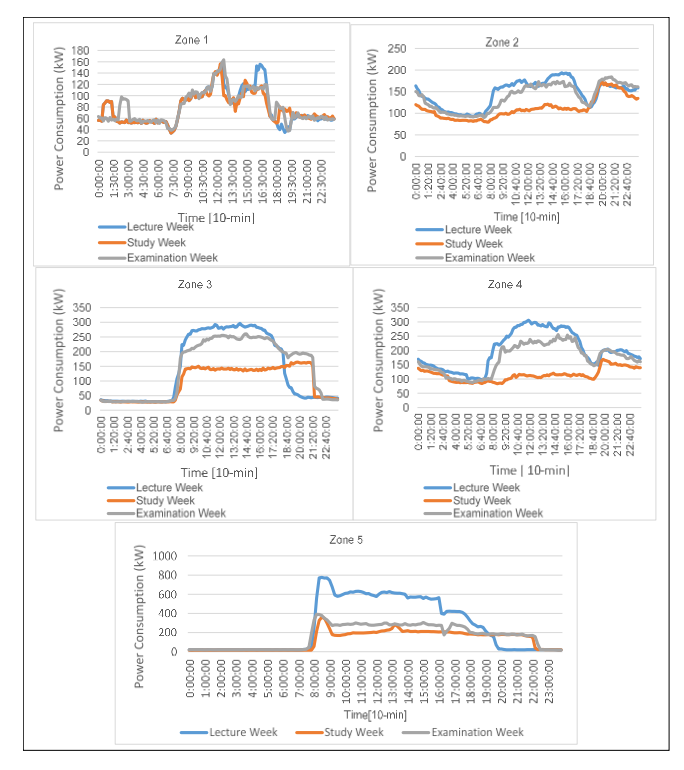
Fig.5: Daily load profile at different zones during distinctive week (lecture, study and examination week)