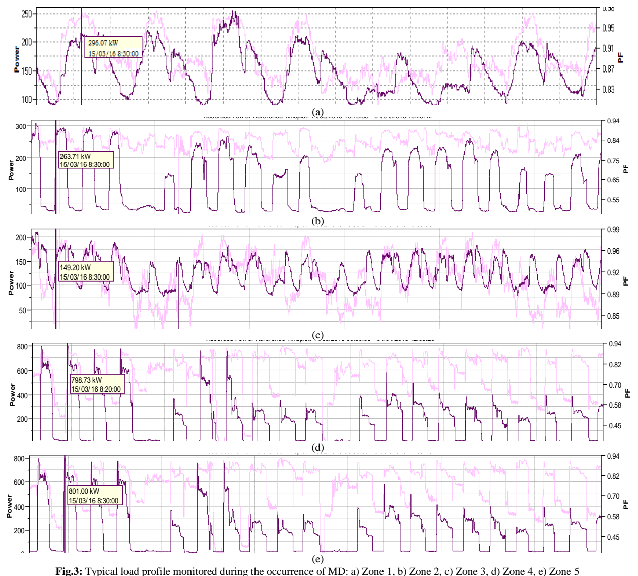
Fig.s. Typical load profile monitored during the occurrence of MD. a) Zone 1, b) Zone 2, c) Zone 5, d) Zone 4, c) Zo

From a micro perspective, further comparisons were made at different zone and period as depicted in Fig.5. A daily sample were taken on Wednesday during LW, SW and EW to understand the cluster pattern of LP. Zone 1 has a very similar pattern during these three (3) weeks because of the transformer is supplying to the administration and auxiliary police office that run its operation constantly from 8 am to 5 pm daily. Heavy usage of electricity is recorded during LW at zone 5 since teaching activities were still conducted and the consumption of chillers need to operate at its full swing thus contributing to the challenges of energy conservation. Apart of zone 1, the other zones recorded the highest usage during LW and least during SW. Obviously during SW, no lecture will be conducted and most of the students are more incline to do revision at their own place. The occupancy of the lecture hall and multipurpose buildings is lower during examination week since only written examinations were conducted at that time.