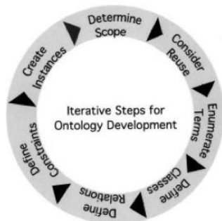
Fig. 1: Ontology 101 development steps

Ontology modelling is a complex task. Ontology development is not new as several methodologies and methods has already been proposed. The comparative study was carried out by [13-14]. METHONTOLOGY is said as a prominent approach used by researchers [15]. Nevertheless, the work carried in [16-17] concluded that there are no methodologies that fit to develop any ontology with various viable alternatives. The basis of developing an ontology depends on the specific requirement for application domain itself. The Ontology Development 101 method proposed by [16] has been chosen as the basis and guidance for this research paper's ontology modelling. This methodology consists of five phases: specification, integration, conceptualizations, implementation and evaluation, as shown in Figure 1.