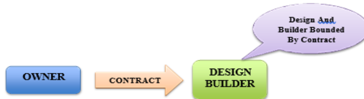
Fig. 1: Relationship between Project Owner and Implementer-Builder of Design and Build Work [12].

The following figure shows the relationship between the Project Owner and the Implementer-Builder of design and build work